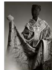
Born of Fire And Fury Io, Observes His Colder Cousins With Interest Giclée Print on Archival Pearl Linen 32 x 42 Inches Paper Signed 1 of 1 + 1AP Blind Stamped Verso