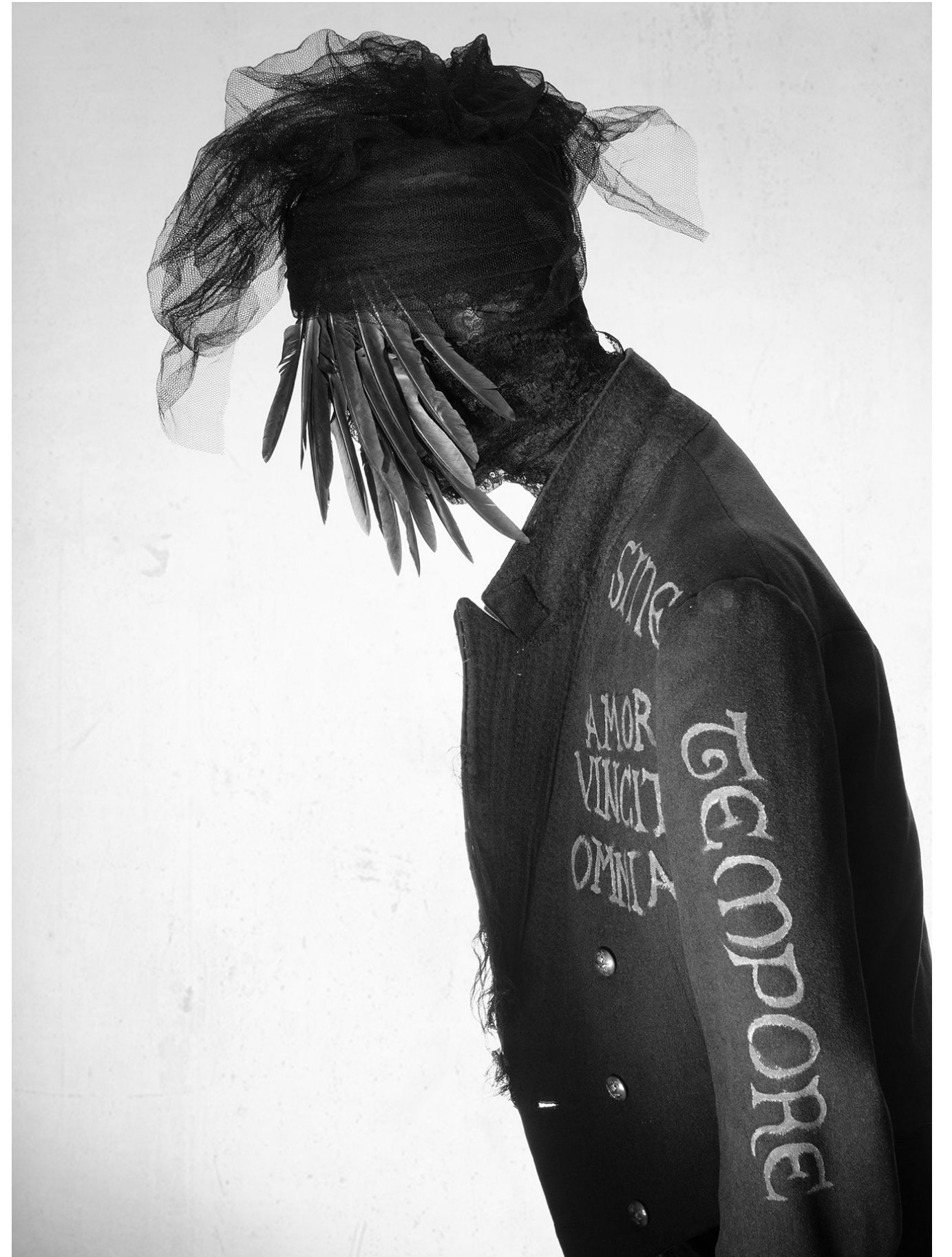
Fárbauti, Wild and Sly with Intentions Unclear ( Sine Tempore / Amor Vincit Omnia )