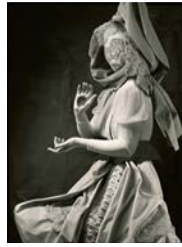
Enceladus, In Eclipse, Weeps Icy, Frustrated Tears Giclée Print on Archival Pearl Linen 32 x 42 Inches Paper Signed 1 of 1 + 1AP Blind Stamped Verso