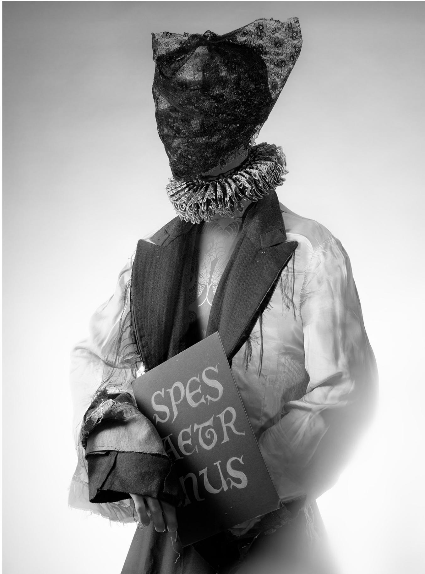
At The Frozen Outer Boundary, Hydra Guards The Entrance To The Next Life