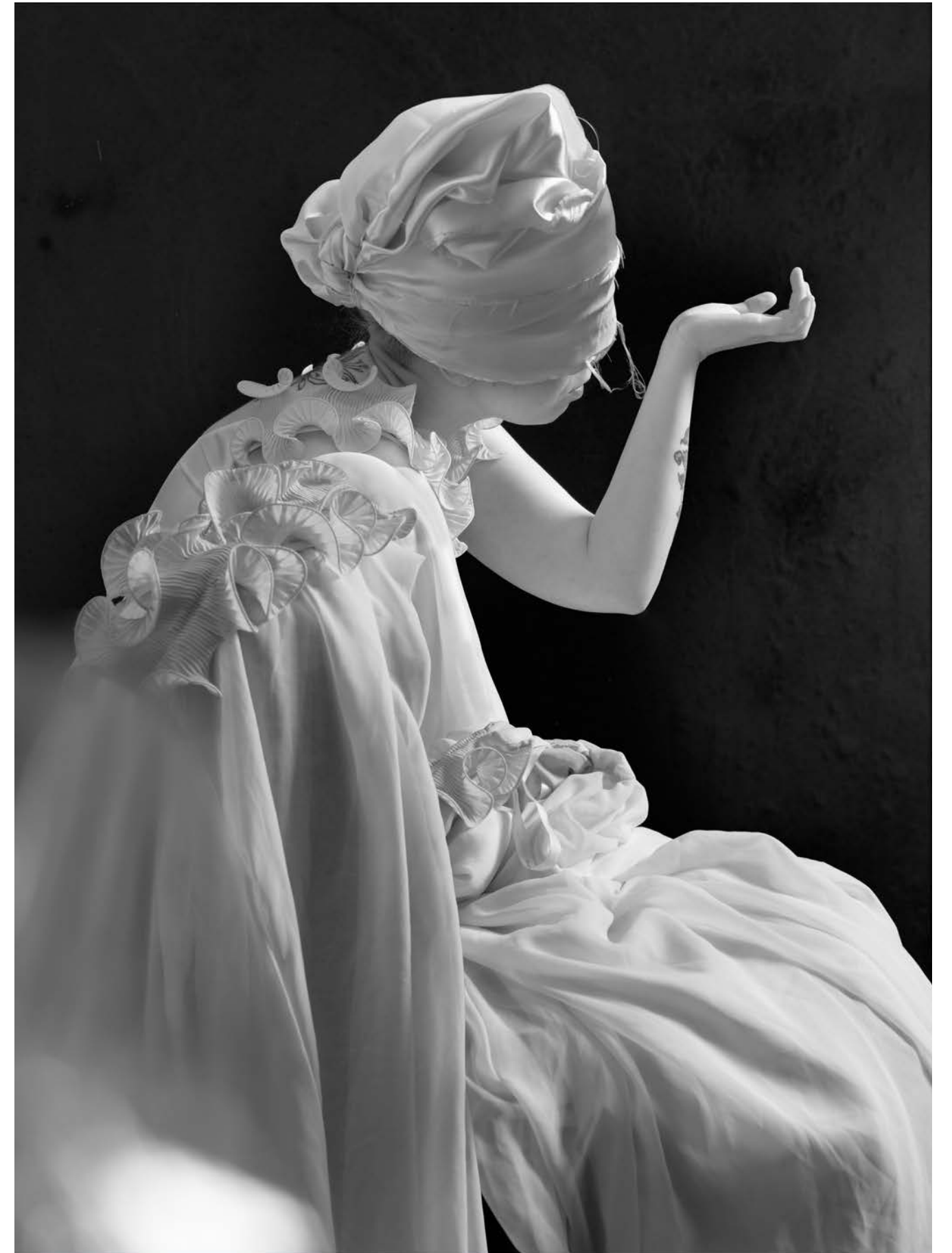
Methone Observes The Winter Solstice and Calms The Solar Winds