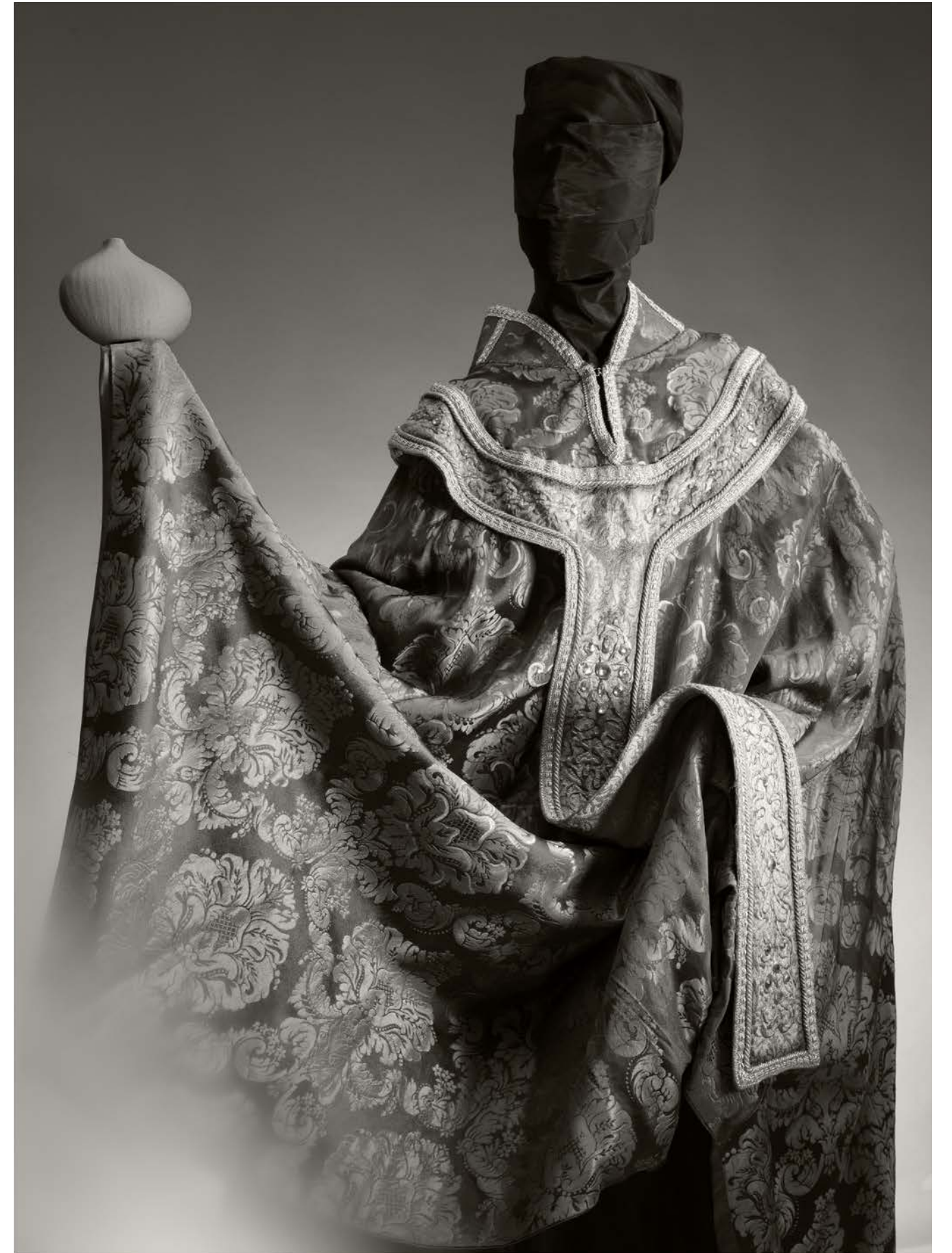
Born of Fire And Fury, Io Observes His Colder Cousins With Interest