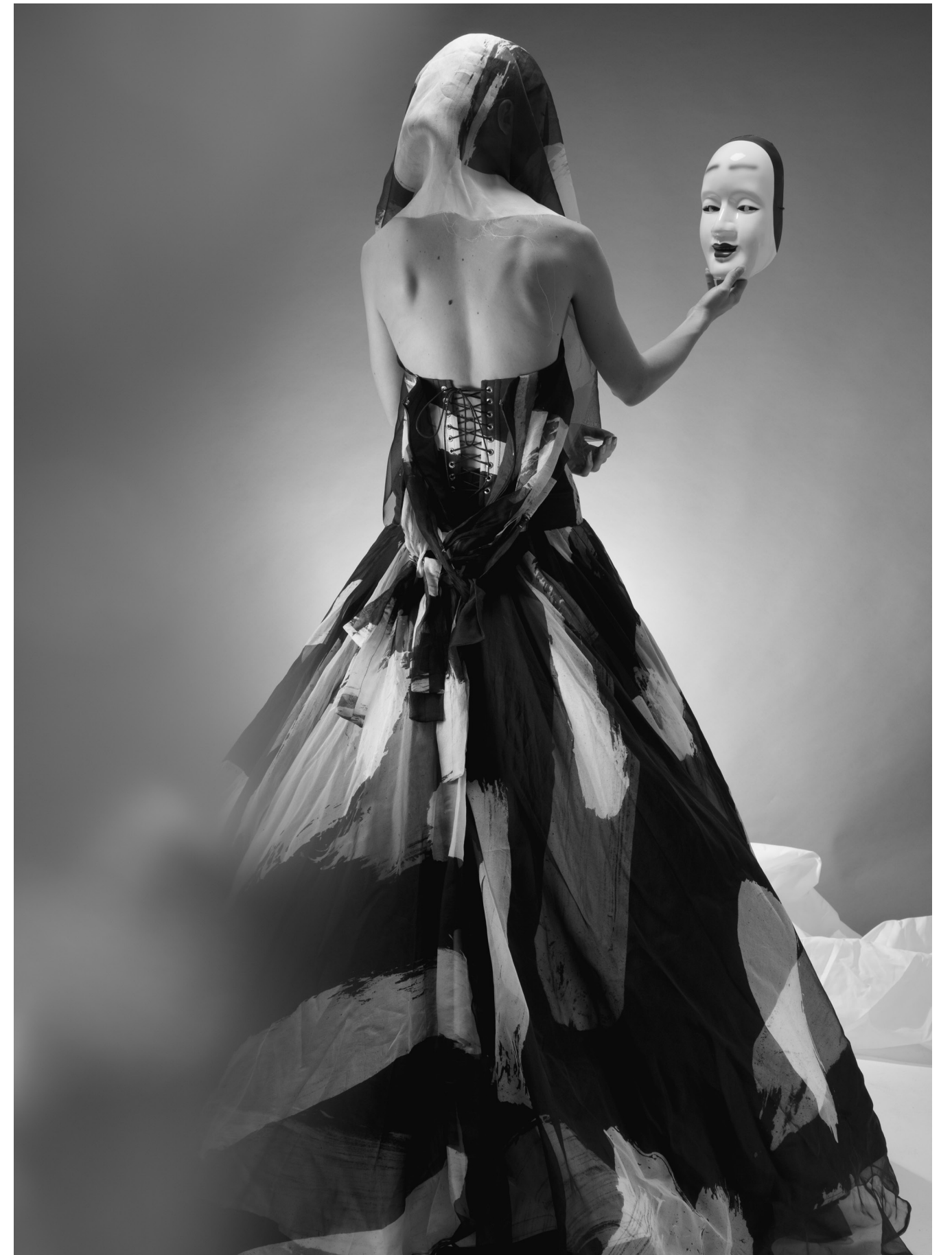
Tsukuyomi Turns Their Face To The Sun