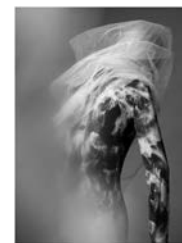
Almost Hidden By the Nightside of Jupiter, Eirene Preaches Peace To Anyone Who Will Listen Giclée Print on Archival Pearl Linen 32 x 42 Inches Paper Signed 1 of 1 + 1AP Blind Stamped Verso