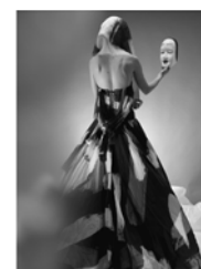
Tsukuyomi Turns Their Face To The Sun Giclée Print on Archival Pearl Linen 32 x 42 Inches Paper Signed 1 of 1 + 1AP Blind Stamped Verso