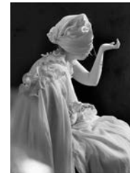
Methone Observes The Winter Solstice and Calms The Solar Winds Giclée Print on Archival Pearl Linen 32 x 42 Inches Paper Signed 1 of 1 + 1AP Blind Stamped Verso