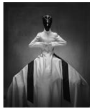
Europa Tends To Her Oceans and Bides Her Time Giclée Print on Archival Pearl Linen 32 x 38 Inches Paper Signed Edition of 1 + 1AP Blind Stamped Verso