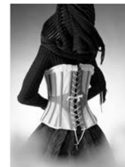
Charon, Tidally Bound, Forever Faces Pluto With Adoration Giclée Print on Archival Pearl Linen 32 x 42 Inches Paper Signed 1 of 1 + 1AP Blind Stamped Verso