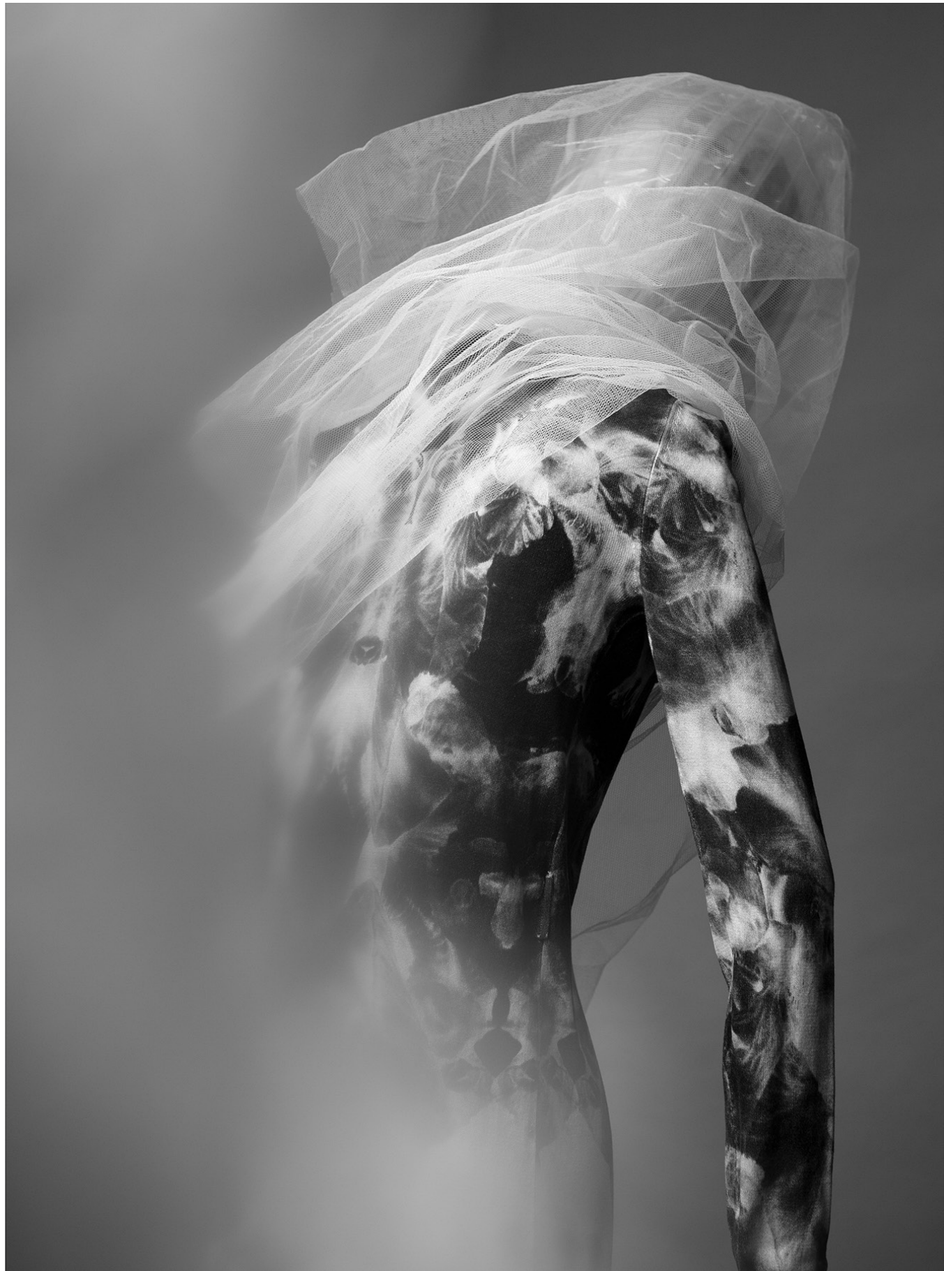
Almost Hidden By the Nightside of Jupiter, Eirene Preaches Peace To Anyone Who Will Listen