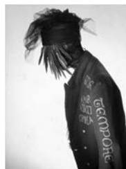
Fárbauti, Wild and Sly with Intentions Unclear ( Sine Tempore / Amor Vincit Omnia ) Giclée Print on Archival Pearl Linen 32 x 42 Inches Paper Signed 1 of 1 + 1AP Blind Stamped Verso