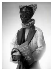
At The Frozen Outer Boundary, Hydra Guards The Entrance To The Next Life Giclée Print on Archival Pearl Linen 32 x 42 Inches Paper Signed Edition of 1 + 1AP Blind Stamped Verso