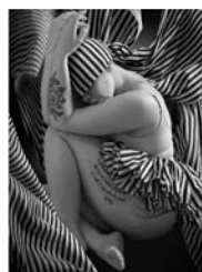
Cyllene Sleeps in Her Mountain Cave and Dreams of Blackbirds Giclée Print on Archival Pearl Linen 32 x 42 Inches Paper Signed 1 of 1 + 1AP Blind Stamped Verso