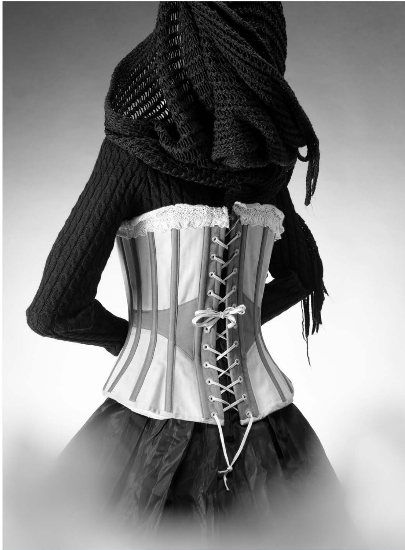
Charon, Tidally Bound, Forever Faces Pluto With Adoration